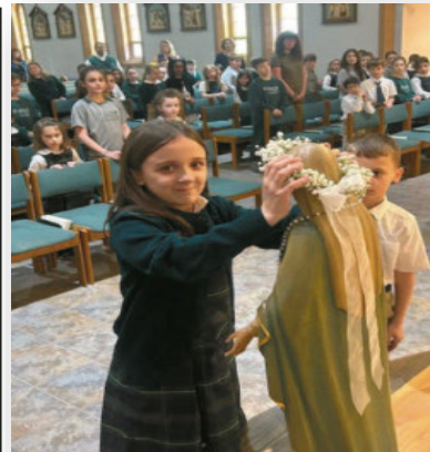
St. Jude's School