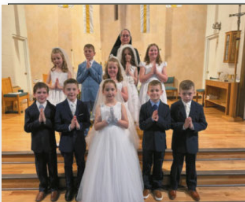
St. Jude's School Children