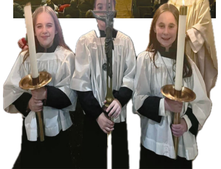
The Children performing the Christmas Pageant and the Altar servers at the 4:00pm Christmas Eve Mass at St. Jude the Apostle Church.

O God of every nation: From the very beginning of creation you have made manifest your love: When our need for a Savior was great, you sent your Son to be born of the Virgin Mary. To our lives He brings joy and peace, justice, mercy and love. Lord, bless all who look upon this manger, may it remind us of the humble birth of Jesus, and raise up our thought to Him, who is our Emmanuel and Savior of all, who lives and reigns forever and ever. Amen.