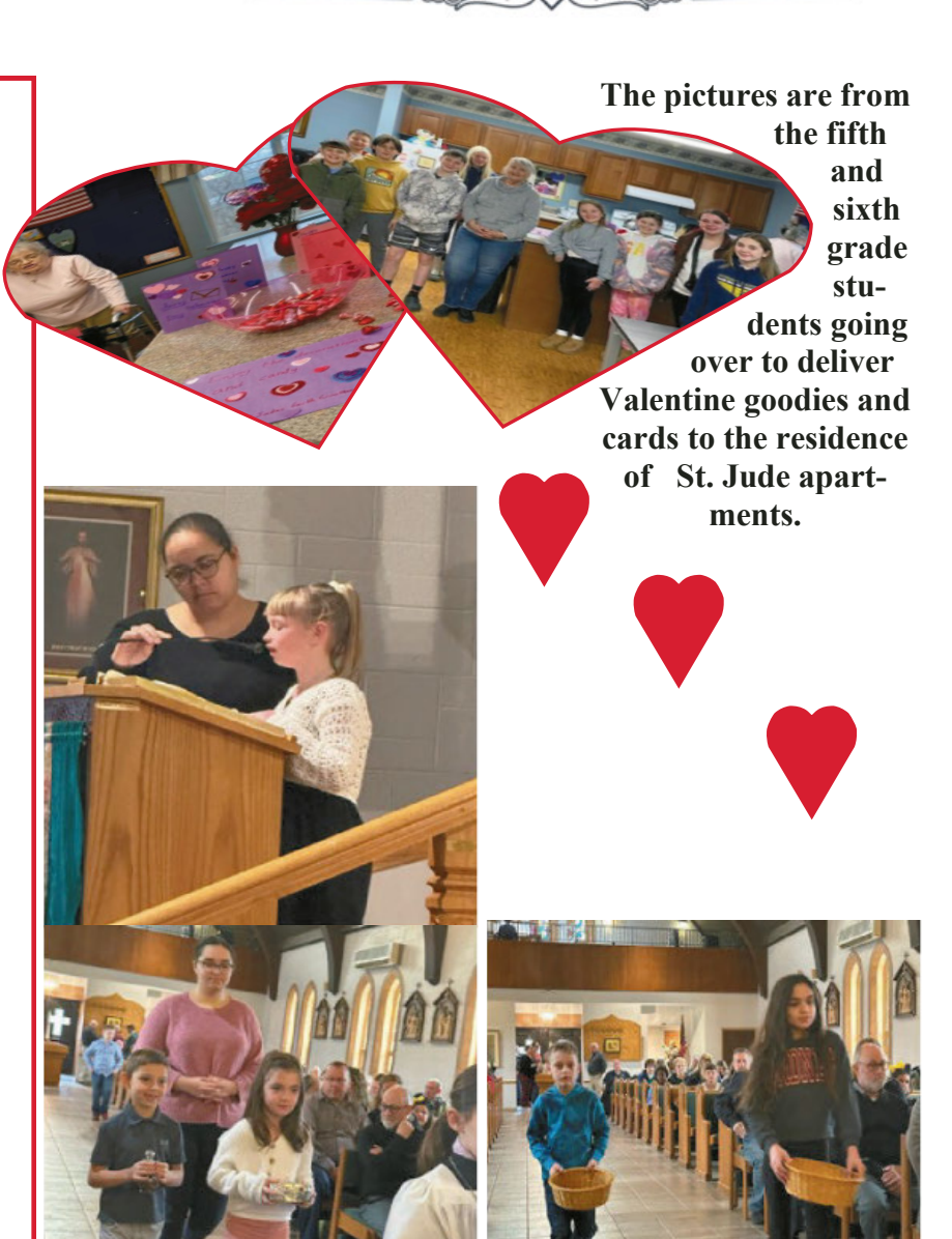
Family Liturgy with grades K - 4