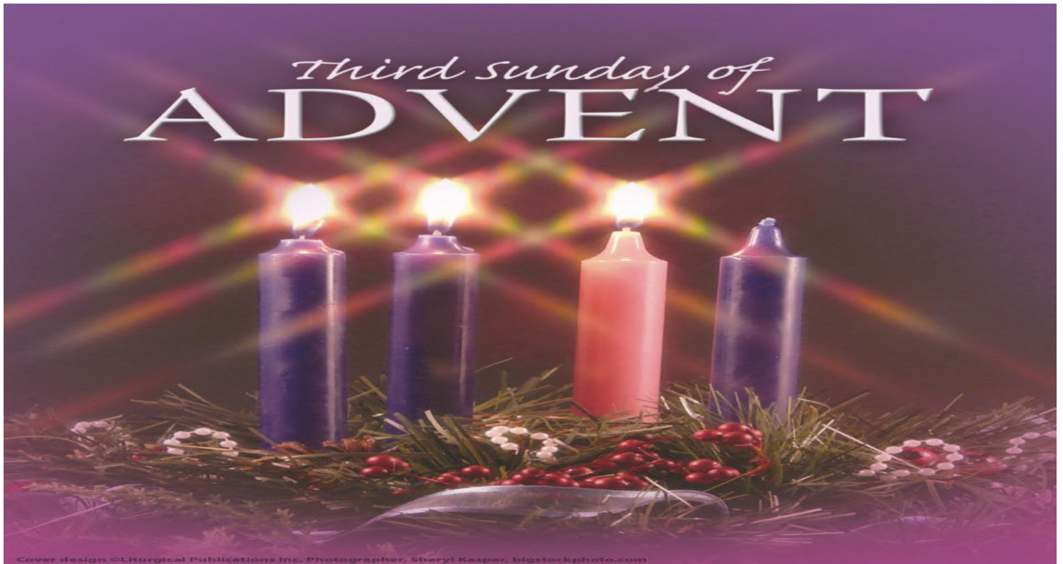
Cover design ©Liturgical Publications Inc.

42 Dana Ave ♦ Wynantskill, New York 12198 ♦ 518-283-1162 ♦ https://parishes.rcda.org/stjude