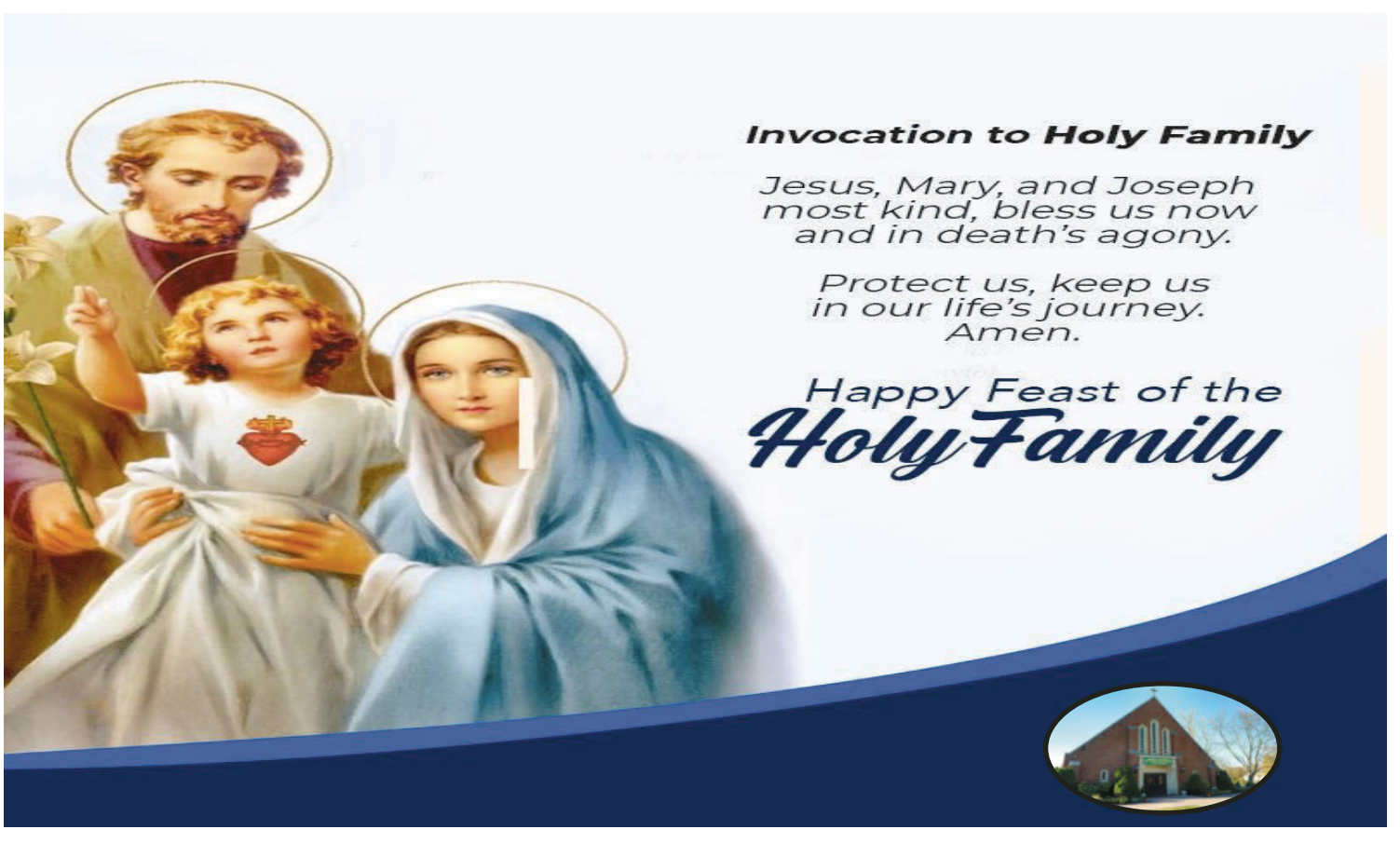
Please note, St. Jude the Apostle Church office is closed December 25th—Janaury 1st, 2024 Happy New Year to all our families!

42 Dana Ave ♦ Wynantskill, New York 12198 ♦ 518-283-1162 ♦ https://parishes.rcda.org/stjude