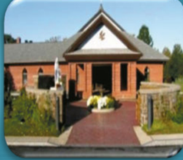
St. Michael the Archangel Church

42 Dana Avenue Wynantskill, NY 12198 518-283-1162