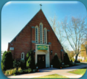
St. Jude the Apostle Church

42 Dana Avenue Wynantskill, NY 12198 518-283-1162