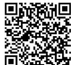
Historic St. Mary's