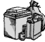
Food Pantry Donations Needed

** The food pantry has a new phone number! ** We can be reached at 518-414-1929