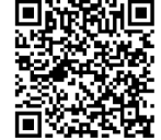
Historic St. Mary's