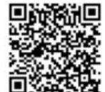
Historic St. Mary's