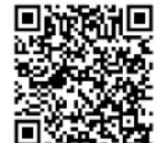
Historic St. Mary's