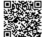
Historic St. Mary's