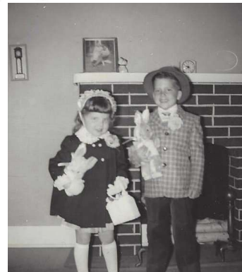
Easter Mass...a long time ago...yet timeless.