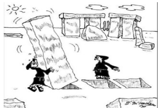
"You got it wrong again. It's spring ahead, fall back."

Our assessment this year is $23,738.00. So far we collected $7,423.33, the remaining amount to raise is $16,314.67. Thank you very much! Let us continue the ministry and good works of Jesus throughout our 14 county Diocese. Envelopes are in the pews.