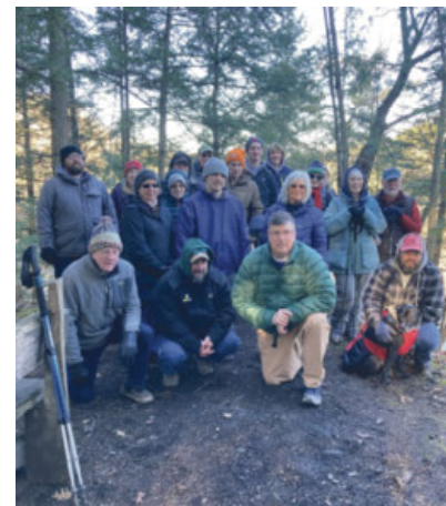
First Day Hike... what a beginning!

We're continuing to collect diapers and baby wipes for Community Maternity Services in the bassinets in the hall. Please no toys or baby furniture, diapers and wipes only. Thank you for your continued support of this important need in our community.