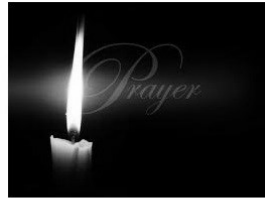
Book of Intentions

Did you know... there is a Book of Intentions near the entrance to the church (back door at St. Paul's) for you to enter the names of your living and/or deceased loved ones? The Book is brought up with the gifts at all of our masses during the year. Those in the book are always remembered in a special way at all Masses.