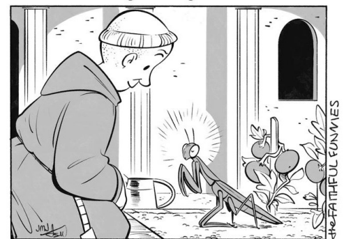
"A praying mantis."

"Which insect did the abbot permit in his vegetable garden?"