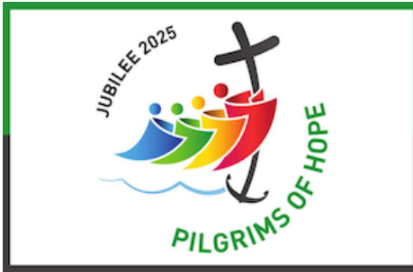
image and text from: https://www.iubilaeum2025.va/en/giubileo-2025/segni-del-giubileo.html

SACRAMENT OF RECONCILIATION: Every Saturday 4–4:45 p.m., St. Mary's Oneonta. Call the parish office (607-432-3920) for an appointment if you need a different time.