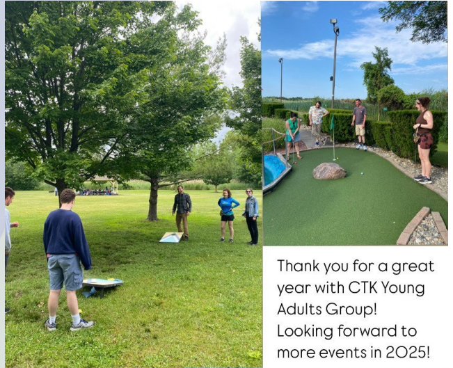
Thank you for a great year with CTK Young Adults Group! Looking forward to more events in 2025!

If you are in need of a prayer shawl, they are available in the parish office during office hours. They are lovingly made by our Prayer Shawl Ministry and represent a way to share God's love to those in need of comfort and solace.