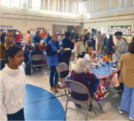
Photos from our International Event last Sunday. See more on our Facebook page!