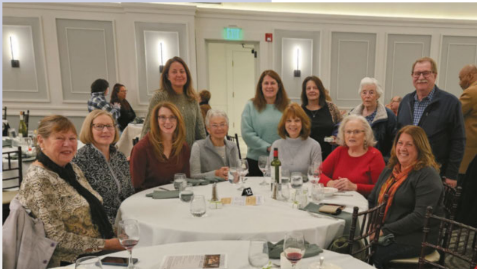
Our Garden Ministry enjoyed their end of season fellowship and dinner! Thank you for keeping our grounds a place of beauty inspiring prayer this year!

Registration for our next drive on December 7th is open, sign up today to help save a life! To register, visit www.redcrossblood.org and use sponsor code churchchristking . Thank you again for taking time out of your busy lives.