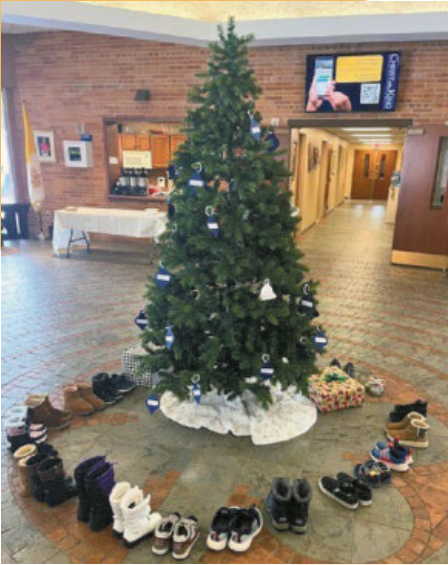
Our young people left their shoes for St. Nicholas last weekend!