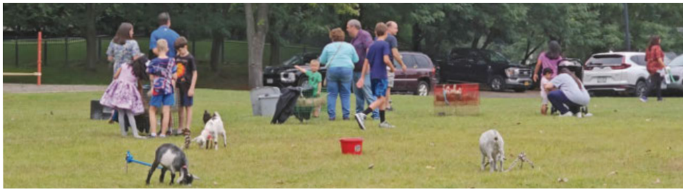
Parish Picnic 2023