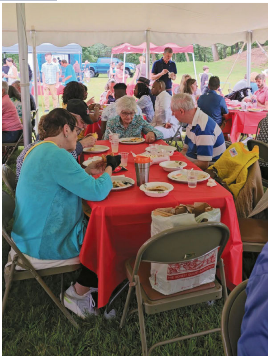
Parish Picnic 2023