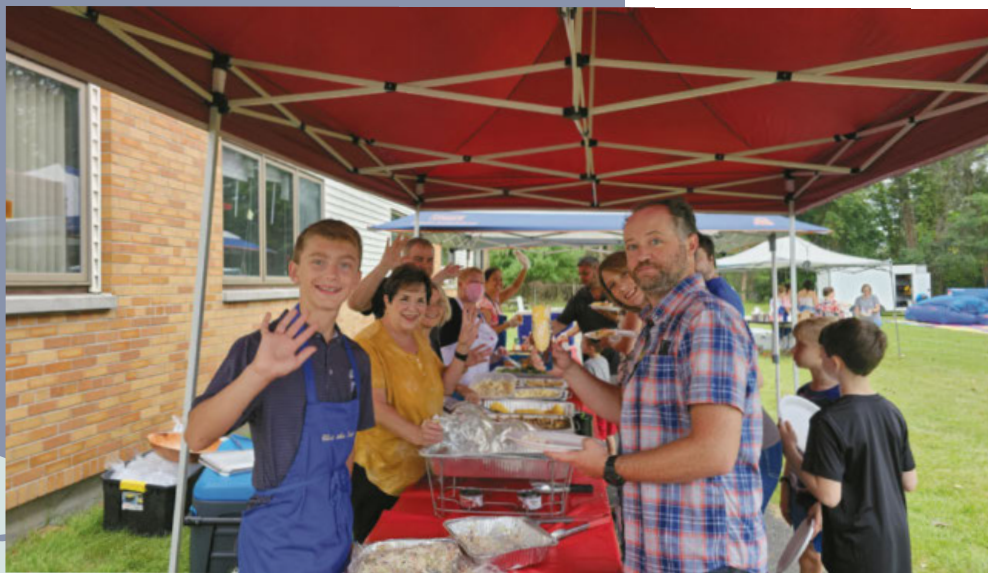
Parish Picnic 2023

Viewing of The Chosen will happen at 6 pm on the following Sundays: September 17 &