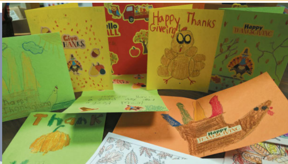
Thanksgiving cards created for Equinox, Inc. by our Faith Formation students

Family Life ministry honors our veterans both living and deceased through our annual Operation Peace CTK. Brown rosary beads were handmade and blessed for our first responders, veterans and military. We pray the Rosary, especially at this time, for for peace in our hearts, families, community and world to Jesus through Mary, which safeguards our troops, veterans and first responders physically, emotionally and spiritually. May God and our Blessed Mother Queen of Peace continue to bless and safeguard all those & their families that have served & continue to serve. Blessed brown rosaries and prayer cards are available in the Gathering Space for all our veterans, military and first responders in gratitude for their service. Thank you to our Veterans!