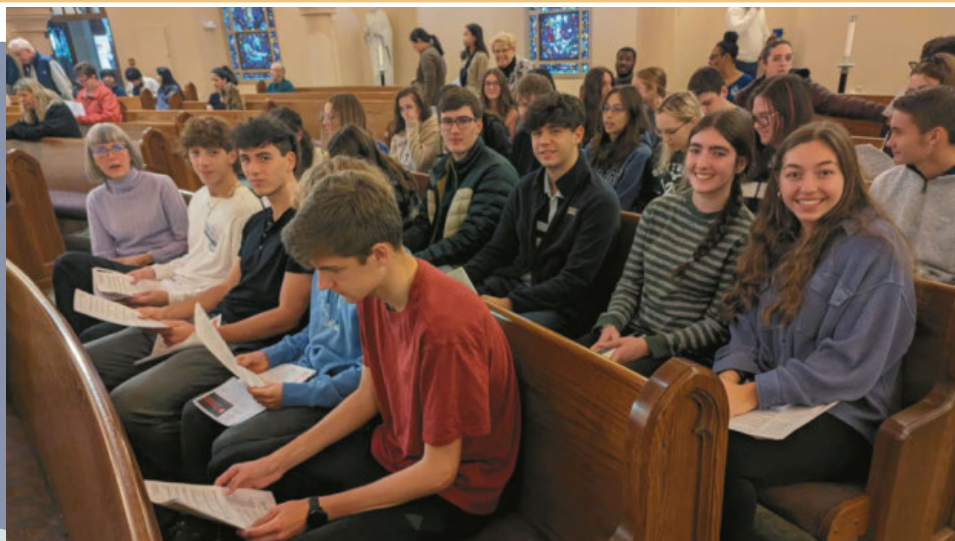
Our Confirmation Candidates at Mass!

So often we are overwhelmed by the material aspect of "getting ready for Christmas" and overlook the real welcoming of Jesus. Please join us on December 3rd, the 1st Sunday of Advent, to celebrate Advent with faith, family, fun and traditions! You can make your own wreath with other families (about ½ hour) and enjoy some refreshments - or- take your materials home to work on them, there will be Advent activities/crafts for children after the 11 am Mass - "Keeping Christ in Christmas" (parent or guardian must be present), and an Advent