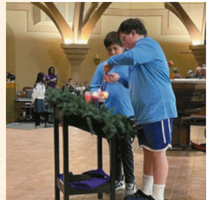
Some of our CYO players assisted at a youth led Mass in December