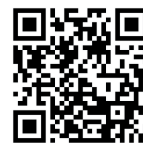
St. Michael the Archangel

Your generosity supports the mission of Saint Jude the Apostle and Saint Michael the Archangel. For those who prefer to give electronically, QR codes for both parishes are available in the bulletin each week. Thank you for your faithful support and for being part of what God is doing in our parish communities.