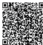
St. Jude the Apostle

Your generosity supports the mission of Saint Jude the Apostle and Saint Michael the Archangel. For those who prefer to give electronically, QR codes for both parishes are available in the bulletin each week. Thank you for your faithful support and for being part of what God is doing in our parish communities.