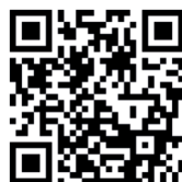
St. Michael the Archangel