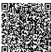
St. Jude the Apostle

Your generosity supports the mission of Saint Jude the Apostle and Saint Michael the Archangel, helping us to worship, serve others, and grow as disciples of Jesus Christ. For those who prefer to give electronically, QR codes for both parishes are available in the bulletin each week. Thank you for your faithful support and for being part of what God is doing in our parish communities.