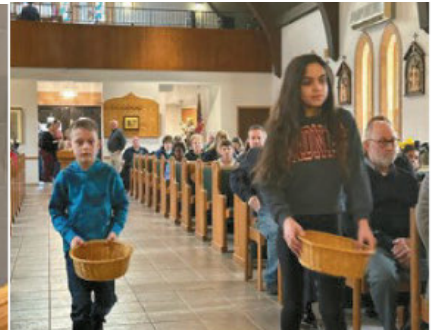
Family Liturgy with grades K - 4