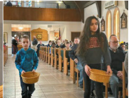
Family Liturgy with grades K - 4