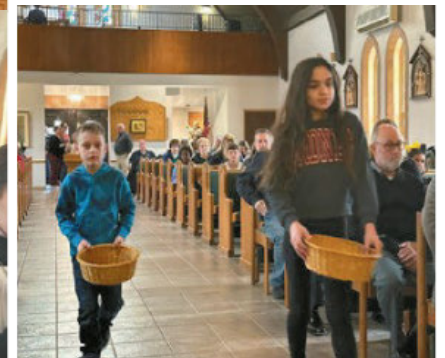
Family Liturgy with grades K - 4