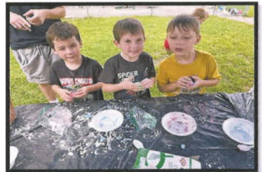
Making Slime for STEM Week