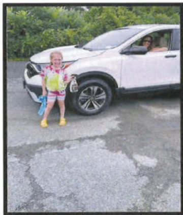
3 rd -5 th Grade Car Wash