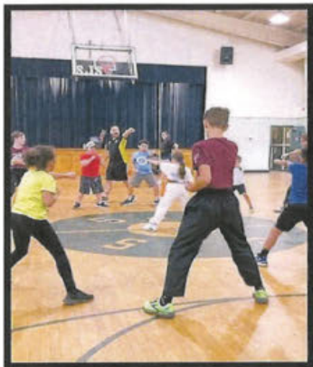
Taekwondo for Olympics Week