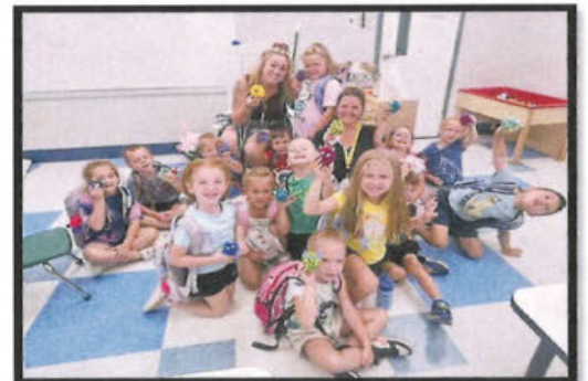
Crafts for Arts & Crafts Week