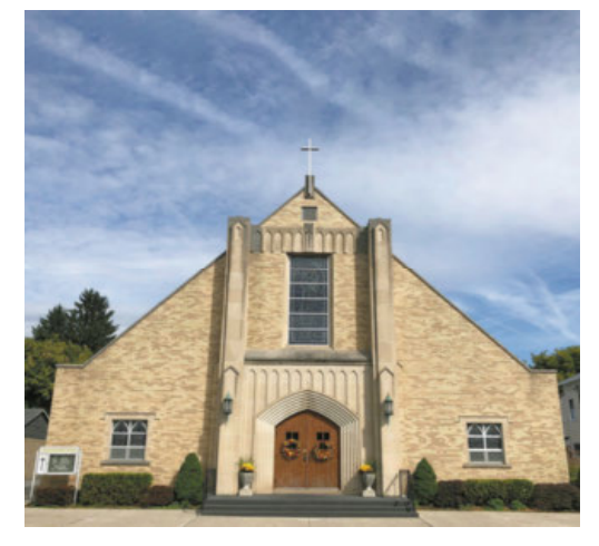
Sts. Anthony & Joseph