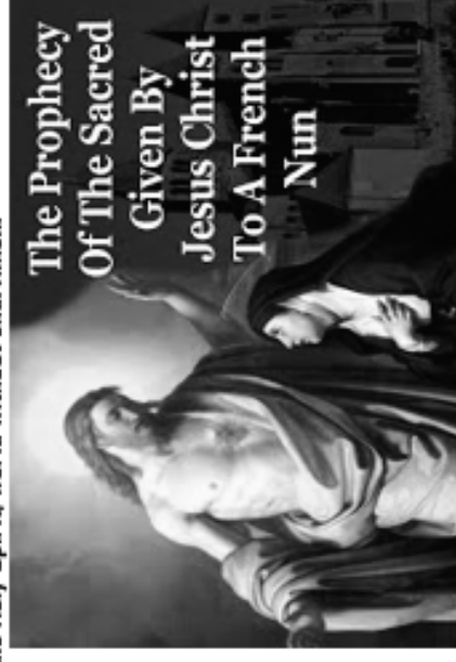
The Apparition of Our Lord Jesus to St. Mary Alacoque December 27, 1873.

Almighty and eternal God, look upon the Heart of Your most-beloved Son, and upon the praises and satisfaction He offers You in the name of sinners; and appeased by worthy homage, pardon those who implore Your mercy, in Your Great Goodness in the name of the same Jesus Christ Your Son, Who lives and reigns with You, in the unity of the Holy Spirit, world without end. Amen.