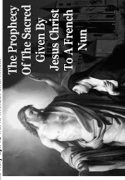
The Apparition of Our Lord Jesus to St. Mary Alacoque December 27, 1873.

Almighty and eternal God, look upon the Heart of Your most-beloved Son, and upon the praises and satisfaction He offers You in the name of sinners; and appeased by worthy homage, pardon those who implore Your mercy, in Your Great Goodness in the name of the same Jesus Christ Your Son, Who lives and reigns with You, in the unity of the Holy Spirit, world without end. Amen.