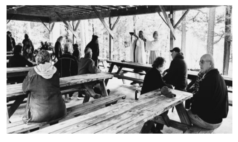
Ascension Thursday Mass at Laselle Park

Want to help our environment wearing snazzy helmets and vests? Clean-up of OLF adopted highway is scheduled for Sunday, June 2<sup>nd</sup> at noon-time. Reminder: As per DOT regulations, vests and helmets must be worn and teens 12 and up accompanied by parents and/or designated guardian