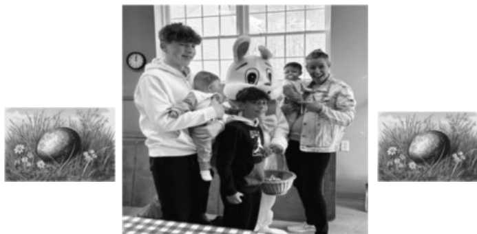
Easter Bunny Extraordinaire

There will be a Communal Anointing of the Sick Sunday, April 28, following the 11:00 AM Mass