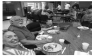
St. Francis of Assisi Feast

Please note that the Liturgy of the Word newsletter is available for our young disciples' grades 1 – 5. They are in plastic bags with crayons that can be used during Mass. Please return plastic bags and crayons and take the newsletter home to go over with your children to review each Sunday's Mass message.