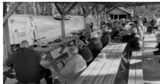
We celebrated the Eucharist and continued the feast with a delicious pasta picnic thanks to the Knights of Columbus.