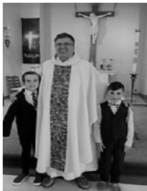
Celebration of their 1st Eucharist

And now the Torch and Poppy Red We wear in honor of our dead Fear not that ye have died for naught; We'll teach the lesson that you wrought In Flanders field