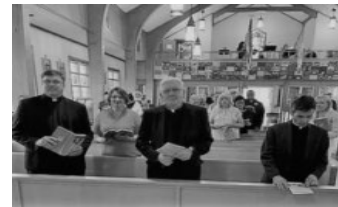
Works of Mercy Initiative Prayer Service

A box will be placed on the table in the back for these supplies Your participation is greatly appreciated