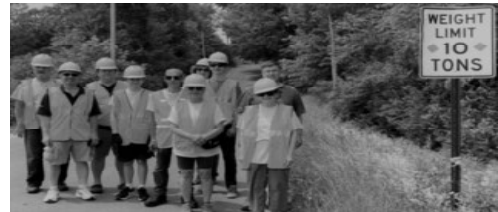
Route 7 Clean up Crew

A box will be placed on the table in the back for these supplies Your participation is greatly appreciated