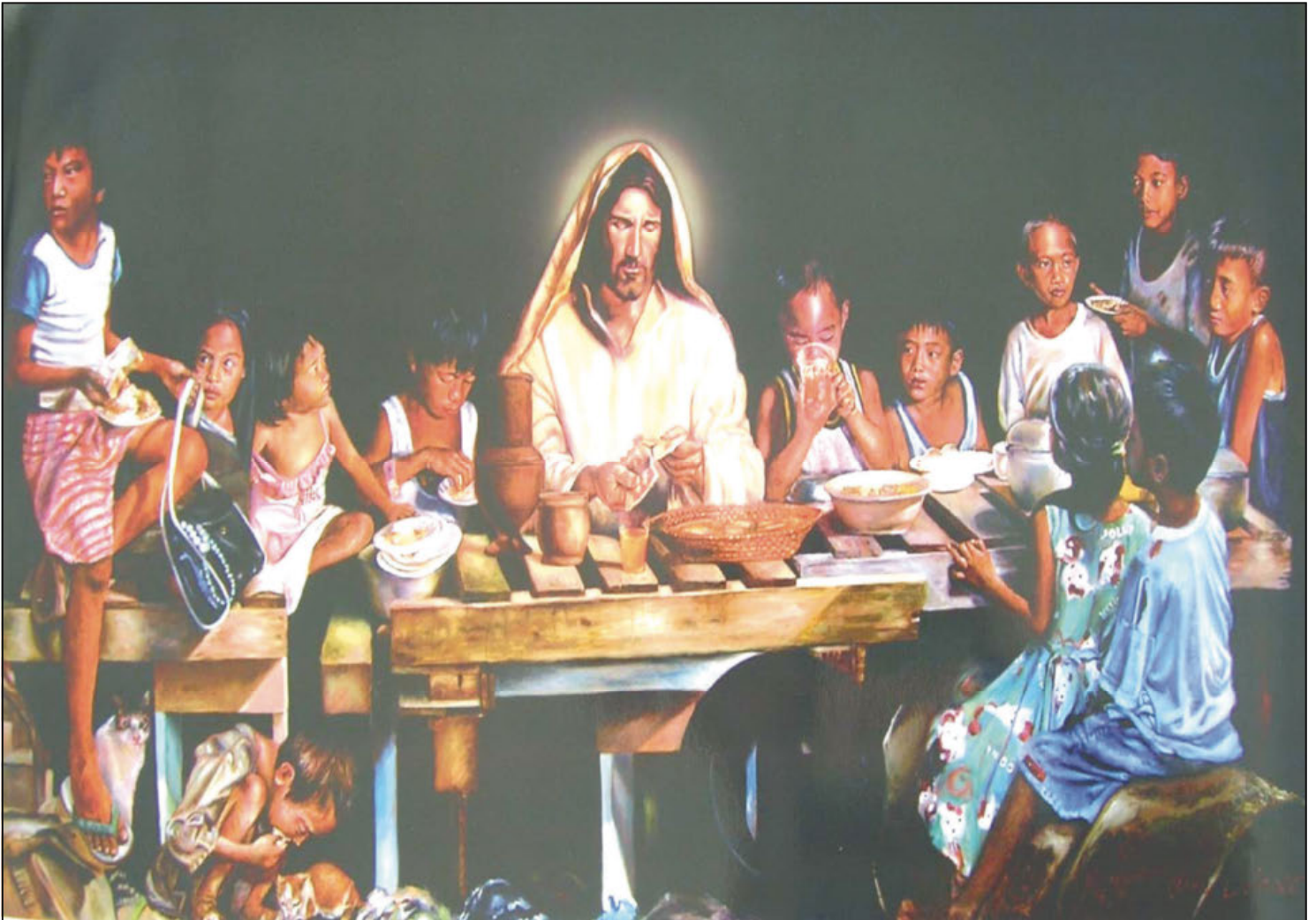
Table of Hope

Our Lady Of Fatima P. O. Box 219 (Mailing Address) 1735 Alexander Rd Delanson, NY 12053 (518) 895-2788, olfdelanson@nycap.rr.com