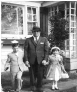
Going to Mass on Father's Day