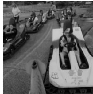
Ladies & Gentlemen Start Your Engines!!

A box will be placed on the table in the back for these supplies Your participation is greatly appreciated