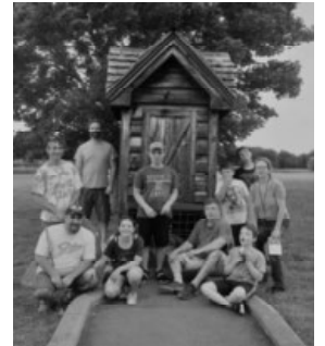
At the 18th hole (The outhouse)

“For me, prayer is an upward rising of the heart, it’s a simple glance toward heaven, it’s a cry of gratitude and love in the midst of trials as much as in the midst of joys. In short, it’s something big, something great, something supernatural that expands my heart and unites me to Jesus.” ~ St. Therese of Lisieux