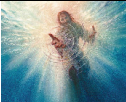
Christ frees us from the waters of death to be givers of life.