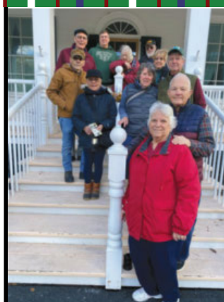
First Day Hike.

We’re continuing to collect diapers and baby wipes for Community Maternity Services in the bassinet in the hall. Please no toys or baby furniture, diapers and wipes only. Thank you for your continued support of this important need in our community.