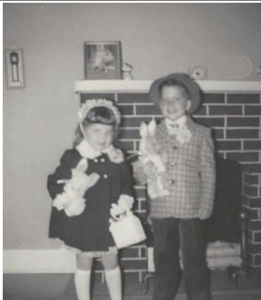
Alleluia! Happy Easter, everyone!

Please return all Rice Bowl donations by Monday, April 28 . Your assistance keeps our Church vibrant in our ministry to the poor throughout our world.