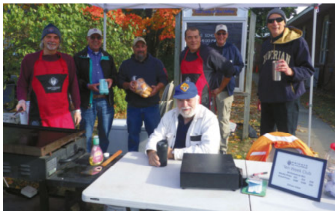
Everyone ate well.

Knights of Columbus are selling raffle tickets for their TEN WEEK CLUB . $10 for a chance to win every week.