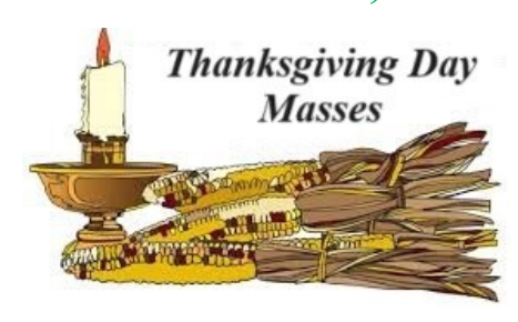
St. Paul's at 9 am Holy Mother & Child at 12 pm