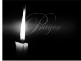
Book of Intentions

Did you know... there is a Book of Intentions near the entrance to the church (back door at St. Paul's) for you to enter the names of your living and/or deceased loved ones? The Book is brought up with the gifts at all of our masses during the year. Those in the book are always remembered in a special way at all Masses.