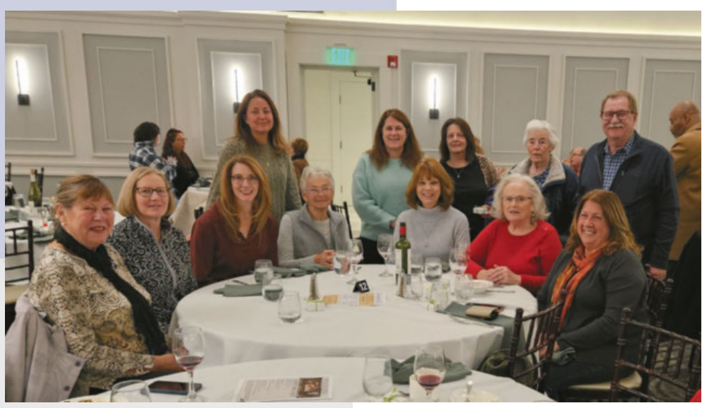
Our Garden Ministry enjoyed their end of season fellowship and dinner! Thank you for keeping our grounds a place of beauty inspiring prayer this year!

Registration for our next drive on December 7th is open, sign up today to help save a life! To register, visit www.redcrossblood.org and use sponsor code churchchristking . Thank you again for taking time out of your busy lives.