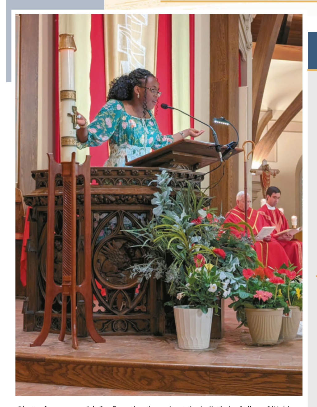
Photos from our parish Confirmation throughout the bulletin