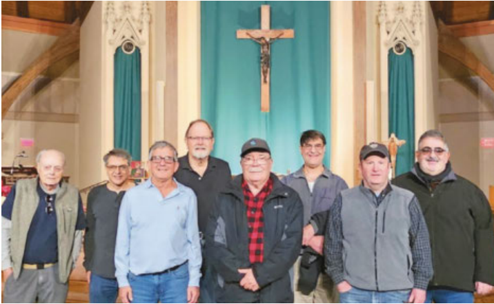
Thank you to the volunteers who change over our large liturgical season banners in the sanctuary numerous times during the year!